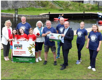
TEXACO SUPPORT FOR SPORT