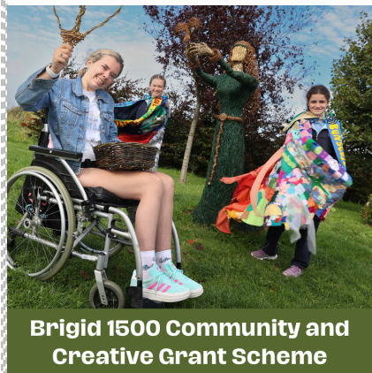
Brigid 1500 Community and Creative Grant Scheme