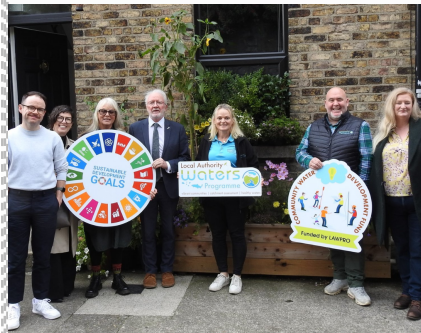
LAWPRO Community Water Development Fund 2024 Now Open