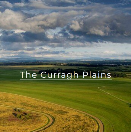
The Curragh Plains